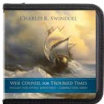
Wise Counsel for Troubled Times by Charles R. Swindoll CD series