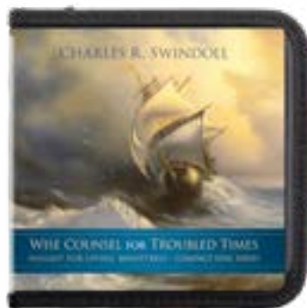
Wise Counsel for Troubled Times by Charles R. Swindoll CD series