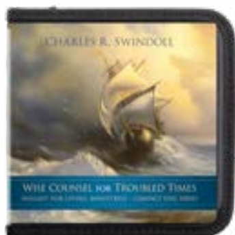
Wise Counsel for Troubled Times by Charles R. Swindoll CD series