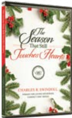
The Season That Still Touches Hearts by Charles R. Swindoll CD series