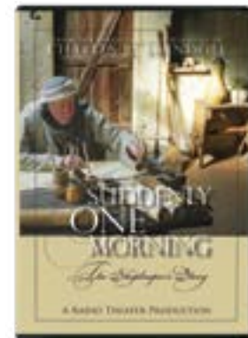
Suddenly One Morning Radio Theater by Charles R. Swindoll single CD

For these and related resources, visit www.insightworld.org/store or call USA 1-800-772-8888 • AUSTRALIA +61 3 9762 6613 • CANADA 1-800-663-7639 • UK +44 1306 640156