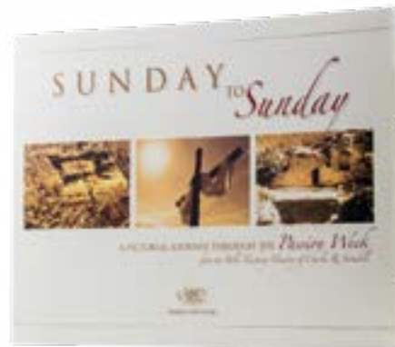
Sunday to Sunday by Charles R. Swindoll and Insight for Living Ministries softcover book