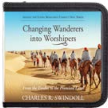
Changing Wanderers into Worshipers: From the Exodus to the Promised Land by Charles R. Swindoll CD series