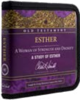
Esther: A Woman of Strength and Dignity by Charles R. Swindoll CD series