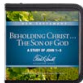
Beholding Christ . . . The Son of God: A Study of John 1–5 — A Signature Series by Charles R. Swindoll CD series

For these and related resources, visit www.insightworld.org/store or call USA 1-800-772-8888 • AUSTRALIA +61 3 9762 6613 • CANADA 1-800-663-7639 • UK +44 1306 640156