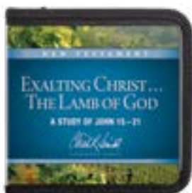
Exalting Christ . . . The Lamb of God: A Study of John 15–21 — A Signature Series by Charles R. Swindoll CD series