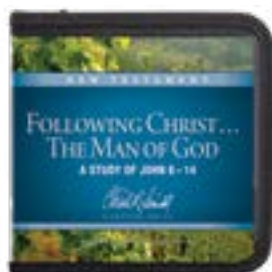
Following Christ . . . The Man of God: A Study of John 6–14 — A Signature Series by Charles R. Swindoll CD series