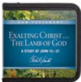
Exalting Christ . . . The Lamb of God: A Study of John 15–21 — A Signature Series by Charles R. Swindoll CD series