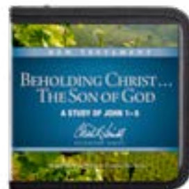
Beholding Christ . . . The Son of God: A Study of John 1–5 — A Signature Series by Charles R. Swindoll CD series

For these and related resources, visit www.insightworld.org/store or call USA 1-800-772-8888 • AUSTRALIA +61 3 9762 6613 • CANADA 1-800-663-7639 • UK +44 1306 640156