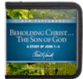
Beholding Christ . . . The Son of God: A Study of John 1–5 — A Signature Series by Charles R. Swindoll CD series

For these and related resources, visit www.insightworld.org/store or call USA 1-800-772-8888 • AUSTRALIA +61 3 9762 6613 • CANADA 1-800-663-7639 • UK +44 1306 640156