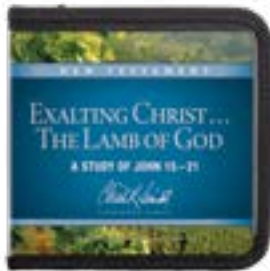
Exalting Christ . . . The Lamb of God: A Study of John 15–21 — A Signature Series by Charles R. Swindoll CD series