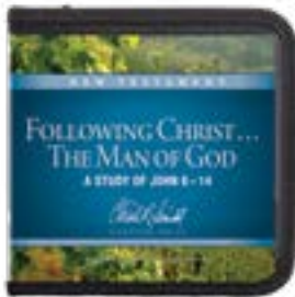
Following Christ . . . The Man of God: A Study of John 6–14 by Charles R. Swindoll CD series