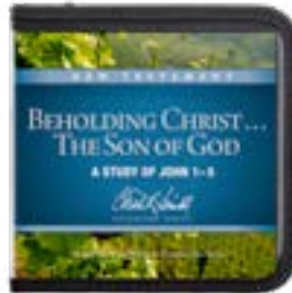
Beholding Christ . . . The Son of God: A Study of John 1–5 by Charles R. Swindoll CD series