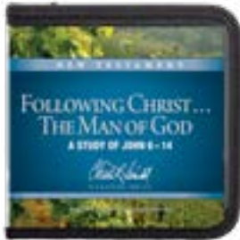
Following Christ . . . The Man of God: A Study of John 6–14 by Charles R. Swindoll CD series