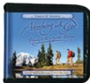
Adventuring with God: Following in the Apostles' Footsteps by Charles R. Swindoll CD Series

For these and related resources, visit www.insightworld.org/store or call USA 1-800-772-8888 • AUSTRALIA +61 3 9762 6613 • CANADA 1-800-663-7639 • UK +44 1306 640156