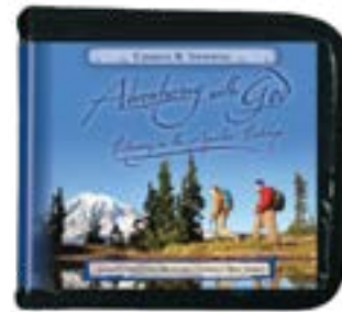
Adventuring with God: Following in the Apostles' Footsteps by Charles R. Swindoll CD Series

For these and related resources, visit www.insightworld.org/store or call USA 1-800-772-8888 • AUSTRALIA +61 3 9762 6613 • CANADA 1-800-663-7639 • UK +44 1306 640156