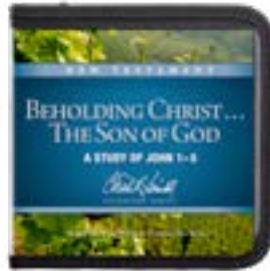
Beholding Christ . . . The Son of God: A Study of John 1–5 by Charles R. Swindoll CD series