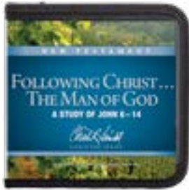
Following Christ . . . The Man of God: A Study of John 6–14 by Charles R. Swindoll CD series