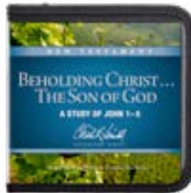
Beholding Christ . . . The Son of God: A Study of John 1–5 by Charles R. Swindoll CD series