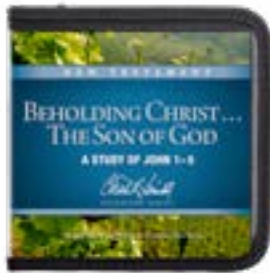
Beholding Christ . . . The Son of God: A Study of John 1–5 by Charles R. Swindoll CD series