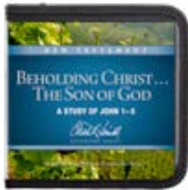
Beholding Christ . . . The Son of God: A Study of John 1–5 by Charles R. Swindoll CD series