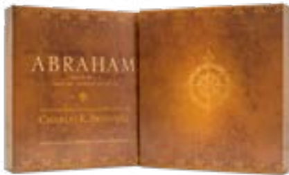
Abraham: One Nomad's Amazing Journey of Faith by Charles R. Swindoll Classic CD series