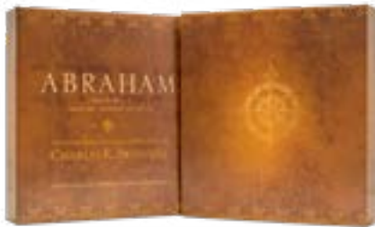
Abraham: One Nomad's Amazing Journey of Faith by Charles R. Swindoll Classic CD series