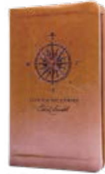
Faith for the Journey: Daily Meditations on Courageous Trust in God by Charles R. Swindoll LeatherLike book

For these and related resources, visit www.insightworld.org/store or call USA 1-800-772-8888 • AUSTRALIA +61 3 9762 6613 • CANADA 1-800-663-7639 • UK +44 1306 640156