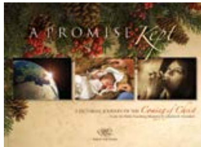
A Promise Kept by Insight for Living Ministries Pictorial devotional