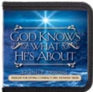
God Knows What He's About by Charles R. Swindoll CD series