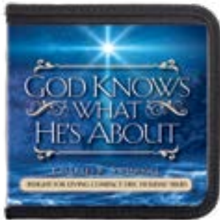
God Knows What He's About by Charles R. Swindoll CD series