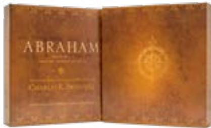
Abraham: One Nomad's Amazing Journey of Faith by Charles R. Swindoll Classic CD series