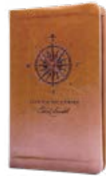
Faith for the Journey: Daily Meditations on Courageous Trust in God by Charles R. Swindoll LeatherLike book

For these and related resources, visit www.insightworld.org/store or call USA 1-800-772-8888 • AUSTRALIA +61 3 9762 6613 • CANADA 1-800-663-7639 • UK +44 1306 640156