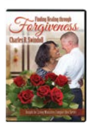
Finding Healing through Forgiveness by Charles R. Swindoll 2-CD set