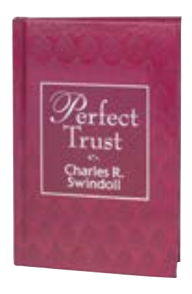
Perfect Trust by Charles R. Swindoll hardback book

For these and related resources, visit www.insightworld.org/store or call USA 1-800-772-8888 • AUSTRALIA +61 3 9762 6613 • CANADA 1-800-663-7639 • UK +44 1306 640156