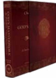
God's Masterwork, Volume Seven: The Final Word—A Survey of Hebrews–Revelation by Charles R. Swindoll CD series

For these and related resources, visit www.insightworld.org/store or call USA 1-800-772-8888 • AUSTRALIA +61 3 9762 6613 • CANADA 1-800-663-7639 • UK +44 1306 640156