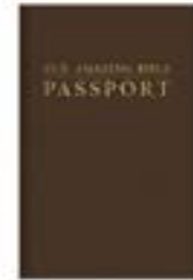
Our Amazing Bible Passport by Insight for Living Ministries softcover book

For these and related resources, visit www.insightworld.org/store or call USA 1-800-772-8888 • AUSTRALIA +61 3 9762 6613 • CANADA 1-800-663-7639 • UK +44 1306 640156