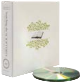
Searching the Scriptures: Find the Nourishment Your Soul Needs by Charles R. Swindoll CD series