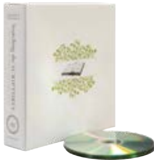
Searching the Scriptures: Find the Nourishment Your Soul Needs by Charles R. Swindoll CD series