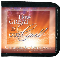
How Great Is Our God! by Charles R. Swindoll CD series