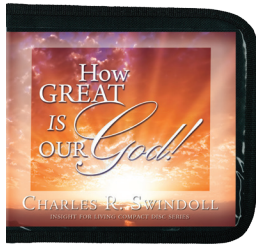
How Great Is Our God! by Charles R. Swindoll CD series