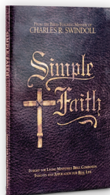
Simple Faith Bible Companion by Charles R. Swindoll softcover Bible Companion