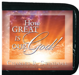
How Great Is Our God! by Charles R. Swindoll CD series