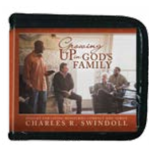
Growing Up in God's Family by Charles R. Swindoll CD series