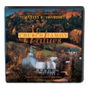
Church Family Values by Charles R. Swindoll CD series