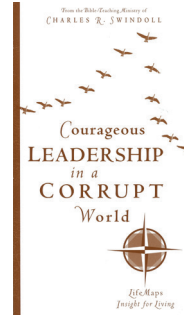
Courageous Leadership in a Corrupt World by Insight for Living Ministries softcover book

For these and related resources, visit www.insightworld.org/store or call USA 1-800-772-8888 • AUSTRALIA +61 3 9762 6613 • CANADA 1-800-663-7639 • UK +44 1306 640156