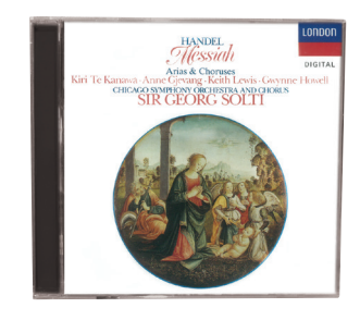
Messiah: Arias & Choruses by Chicago Symphony and Chorus

For these and related resources, visit www.insightworld.org/store or call USA 1-800-772-8888 • AUSTRALIA +61 3 9762 6613 • CANADA 1-800-663-7639 • UK +44 1306 640156