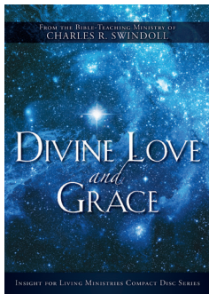
Divine Love and Grace by Charles R. Swindoll CD series