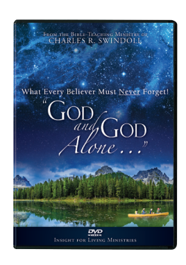
What Every Believer Must Never Forget! "God and God Alone..." by Charles R. Swindoll single message on DVD