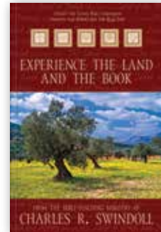
Experience the Land and the Book by Insight for Living Ministries softcover Bible Companion

For these and related resources, visit www.insightworld.org/store or call USA 1-800-772-8888 • AUSTRALIA +61 3 9762 6613 • CANADA 1-800-663-7639 • UK +44 1306 640156