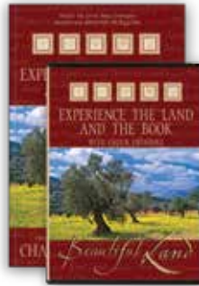
Experience the Land and the Book by Charles R. Swindoll and Insight for Living Ministries DVD and softcover Bible Companion