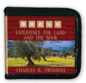
Experience the Land and the Book by Charles R. Swindoll and Insight for Living Ministries compact disc series