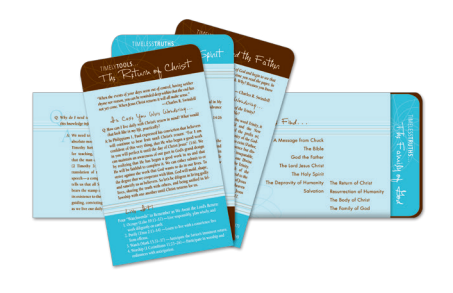
Essential Truths: A Pocket Guide for Growing Deep by Insight for Living Ministries pocket-sized cards

For related resources, please call USA 1-800-772-8888 • AUSTRALIA +61 3 9762 6613 • CANADA 1-800-663-7639 • UK +44 1306 640156