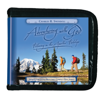
Adventuring with God by Charles R. Swindoll CD series