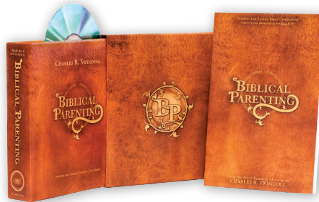
Biblical Parenting by Charles R. Swindoll and Insight for Living Ministries Classic CD series and softcover Bible Companion