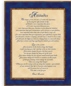
Attitudes Quote Color Print by Charles R. Swindoll color print

For related resources, please call USA 1-800-772-8888 • AUSTRALIA 1300 467 444 • CANADA 1-800-663-7639 • UK 0800 787 9364