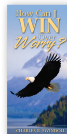
How Can I Win Over Worry? by Charles R. Swindoll booklet