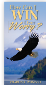
How Can I Win Over Worry? by Charles R. Swindoll booklet