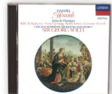
Messiah: Arias and Choruses by Chicago Symphony Orchestra and Chorus CD

For related resources, please call USA 1-800-772-8888 AUSTRALIA 1300 467 444 CANADA 1-800-663-7639 UK 0800 787 9364 or visit www.insight.org or www.insightworld.org