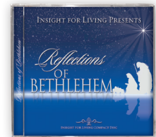
Reflections of Bethlehem by Charles R. Swindoll CD