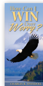
How Can I Win Over Worry? by Charles R. Swindoll booklet