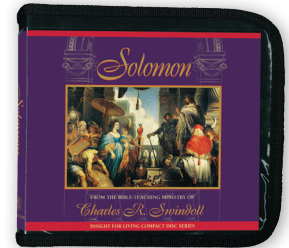
Solomon by Charles R. Swindoll CD series

For related resources, please call USA 1-800-772-8888 • AUSTRALIA 1300 467 444 • CANADA 1-800-663-7639 • UK 0800 787 9364