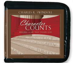
Character Counts: Building a Life That Pleases God by Charles R. Swindoll CD series