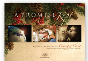
A Promise Kept: A Pictorial Journey of the Coming of Christ by Insight for Living softcover book

For related resources, please call USA 1-800-772-8888 AUSTRALIA 1300 467 444 CANADA 1-800-663-7639 UK 0800 787 9364 or visit www.insight.org or www.insightworld.org