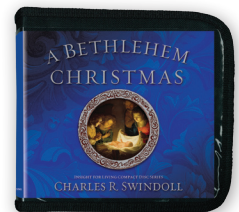
A Bethlehem Christmas by Charles R. Swindoll CD Series