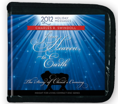
From Heaven to Earth: The Story of Christ's Coming by Charles R. Swindoll CD Series