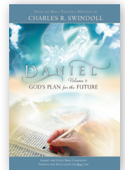
Daniel, Volume 2: God's Plan for the Future Bible Companion by Insight for Living softcover book